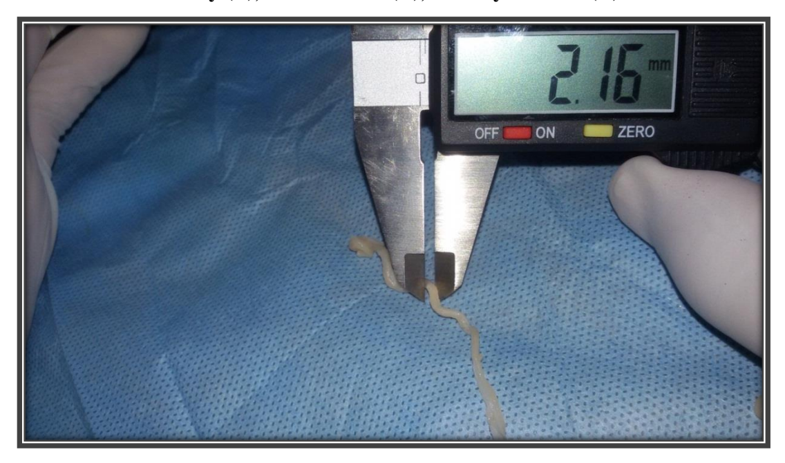
Figure 2. The method of measuring the width of oviduct (external diameter) in goat using digital caliper