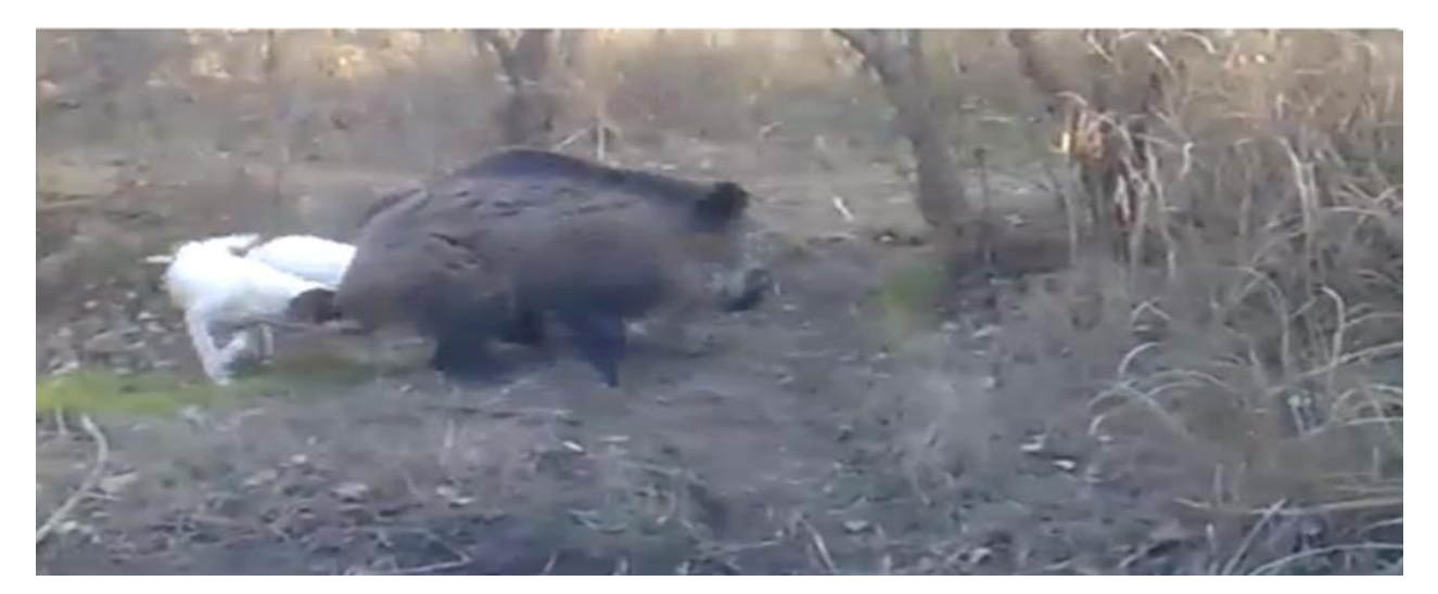
Figure 2. Live wild boar at the time of hunting. It was attacked by two white dogs at Al-Mugdadia, Diyala province