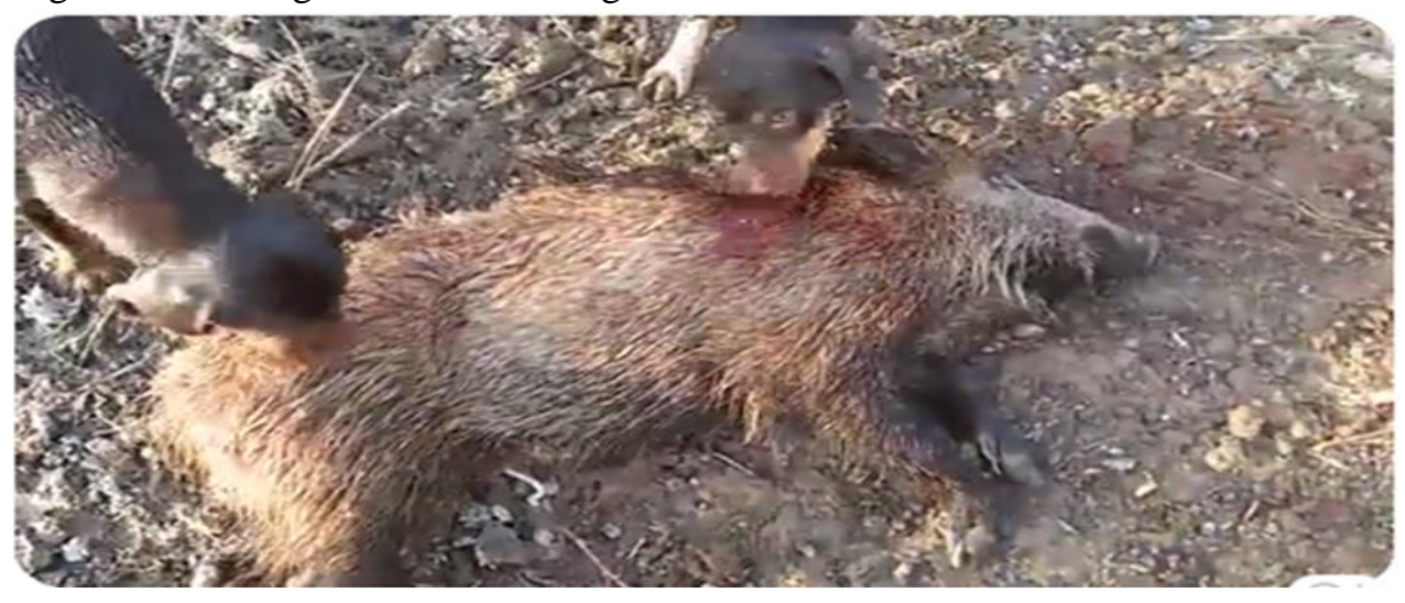
Figure 1. A hunted wild boar in Al-Mugdadia, Diyala province. Two dogs attacked the killed boar

The study was carried out from August 2016 to November 2017. Blood samples were collected from 51 cows, 34 sheep and 15 killed wild boars of different ages (Figure 1 and 2). Furthermore, tissue samples from lymph nodes, tonsils and trigeminal ganglion of 15 killed boars were collected, labeled and kept in -30 °C until use. These animals were distributed in different villages of different local towns of Diyala province and Al-Rahmania village of Al-Suwairah town of Wasit province (Table 1). 10 ml of blood from each animal were collected from Jugular vein using 5 ml size EDTA glass tubes.