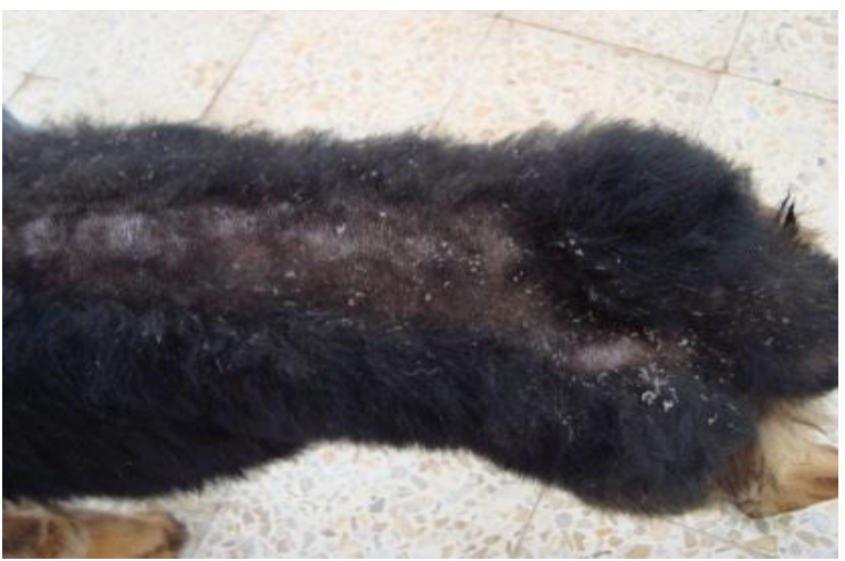
Fig. 3. Extensive skin lesions along back of the animal with alopecia, crusting, hyperkeratosis and ulcers