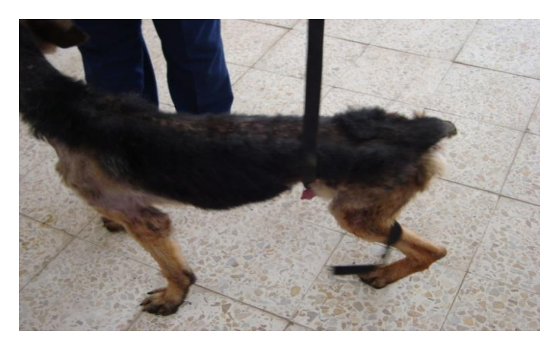
Fig. 5. Severe emaciation and dehydration after about nine months of misdiagnosis and improper treatment