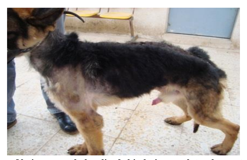
Fig. 1. Failure of hair regrowth, localized skin lesions on lateral aspect of legs and emaciation

Corticosteroids, antihistamine and multivitamins were prescribed for the dog. In January 2014, the dog was presented again; he appeared in a very bad condition, emaciated dehydrated with pale mucous membranes, loss of appetite, failure of hair regrowth, hyperkeratosis, dermatitis, ulcerative lesion on different parts of body mostly in the lateral aspect of the legs, most parts of the tail with extensive involvement of the back of the animal (Fig. 3, 4"A, B" and 5).