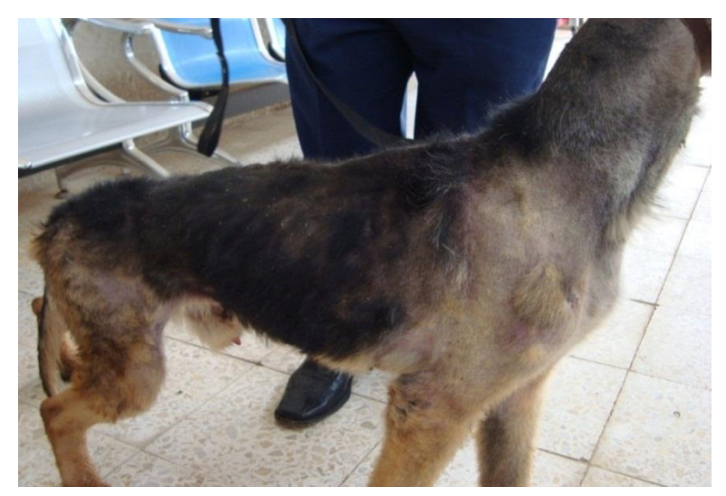
Fig. 2. Emaciation, alopecia with multiple skin pustules and ulcers on right side of the animal