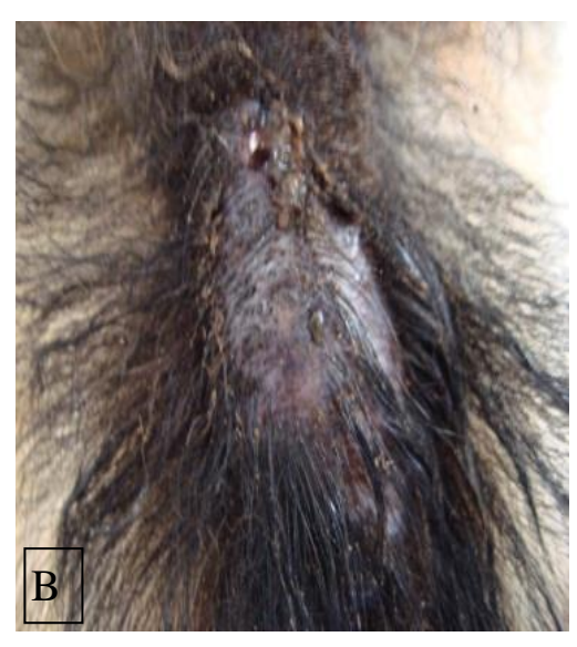
Fig. 4. (A and B) Alopecia and multiple pustules on ventral and dorsal side of tail