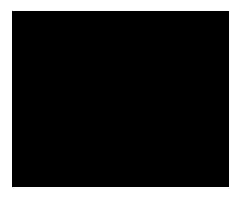
Figure 2. Percentage of moulds contamination fish feed.

The most frequently isolated fungus was Penicillium spp., a 36.4%. Other frequently isolated moulds included Fusarium spp. 24.5%, Aspergillus spp. 20%, Mucor spp.11.1% and Alternaria spp. 8% were represented in smaller amount Figure 2.