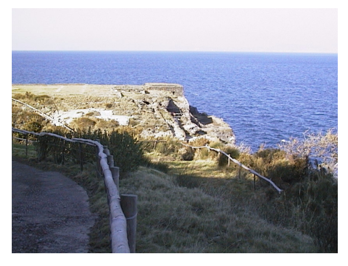
Fig. 4. The Villa di Pollio Felice: the paths

There is the same difficulty when distinguishing the external areas from the internal ones, especially where there are no floors. When the walls or elements of the atria of the buildings are no longer able to evoke the architectural space of the body now reduced to a state of ruin, it becomes important to provide diversified modes of treatment of the soil in order to highlight those difficult to understand aspects, inserting, if compatible with the context, privileged points of view.