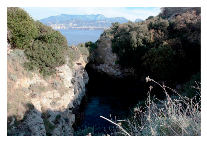
Fig. 1. The Villa di Pollio Felice: the internal basin

It is, therefore, important to identify the links of the networks of energy and mass with the environmental base in which they are carrying the service in such a way as to optimise the configurations for which the networks assume the status of environmental in relation to the various types of contexts. Studying the control of the transformations of the state of the environment with the aim of conserving and preserving, through the development of environmental networks, requires an integrated approach that involves complex, specialised and interrelated issues.