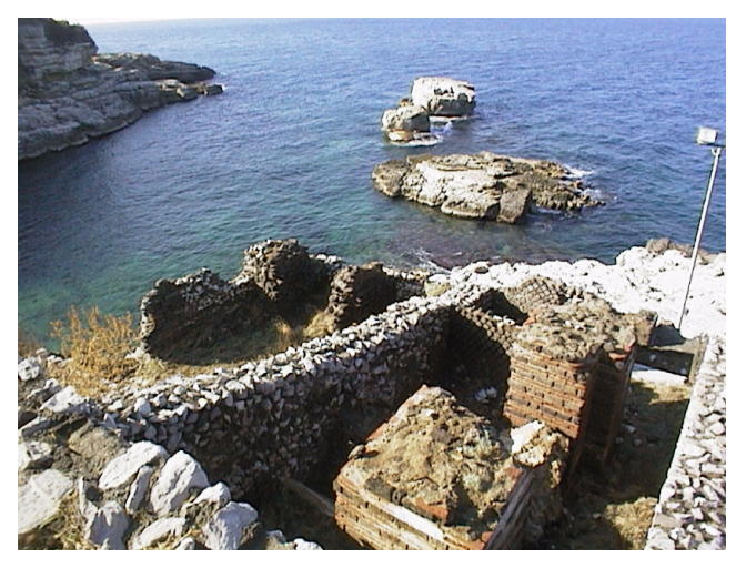
Fig. 3. The Villa di Pollio Felice: the ruins

The architecture seems to take a great advantage of the landscape beauties. The rooms show the greatest usability of the scenery, also thanks to some tricks: divergent walls, wide windows, up to the sophisticated solution of a promenade around the little harbour, with a panoramic viewpoint into the internal part of the apse overlooking the entrance. The most evocative element of the landscape is a natural basin, which the masters used wisely as a dock and swimming pool. It was scenically furnished as we can see from the two examples of the Grotta Azzura in Capri and the Grotta of Sperlonga. The two western small islands show several wall structures and, therefore, it is likely that were connected to the promontory with a bridge.