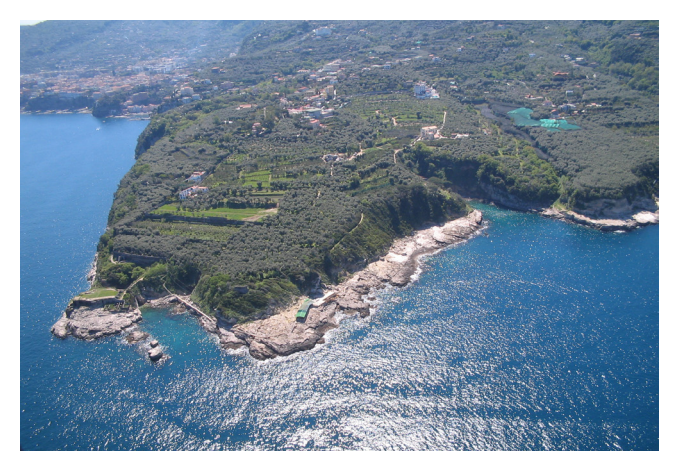
Fig. 2. The Villa di Pollio Felice: overview

This seaside villa , in ancient times, from the I century BC – I century AD, lay on the promontory of Capo di Sorrento. Today, ancient references and comparisons with other Roman villae of the Gulf of Naples, from Posillipo to Campanella (cf. Strabone V 47) give us account of its ruins. The villa of Capo di Sorrento, which the popular tradition knew as I bagni della regina Giovanna (the baths of Queen Giovanna), had an extent of about two hectares.