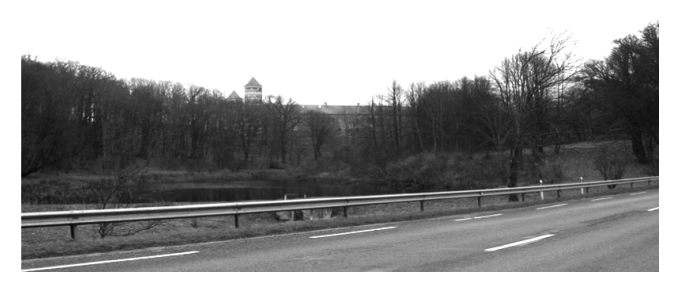
Fig. 3. A view of Panemunė Castle from the road Kaunas – Klaipėda. In 2011, with the help of felling the fragmentary views of the castle were opened

In recent years, a number of important works were implemented to restore and adjust the cultural heritage of Panemune area. From the point of view of visual relations