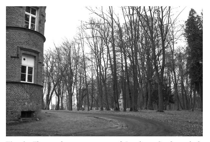
Fig. 2. The north-eastern tower of Raudone Castle and the graveyard of the Soviet soldiers planned to be removed from the park of the castle

Inn suddenly appears. At Žvyriai, behind the oak grove, the cycle track turns to Skirsnemunė settlement, at Molynė village goes down to Nemunas and on its eight kilometres way to Jurbarkas the track winds through the open Nemunas riverbank.