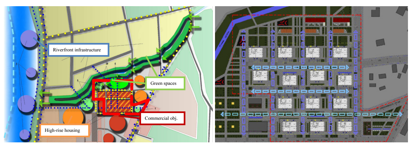
Fig. 2. The conceptual formation of adjacent areas and proposed spatial pattern of the social housing quarter in Panemune

The use of ecological building materials is proposed in the experimental design: flat laminated wood panel façade is chosen, it consists of a steel frame (made from recycled materials), insulation, and pressed wood decorative panels. It was proposed to green the roof terrace as well: part of the roof terraces will be planted with native plant species: woody shrubs and herbaceous plants. System of rain water collection will be equipped: rain water accumulated on the roof will be filtered and collected in a tank in the basement; from there it will be used for watering plants in the roof terrace.