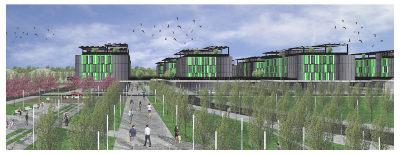
Fig. 3. The experimental design solutions of social housing quarter in Panemune representing the postmodernist or individualist concept ( EFP )