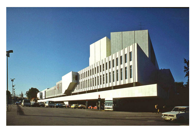
Fig. 12. Finlandia Concert Hall in Helsinki, architect Alvar Aalto, 1962–1975 (Krastiņš, 1992b)

Although in the course of designing the massing of the Daile Theatre was altered several times, the completed building generally reflects the concept of the original competition entry. A two-storey glass foyer with an integrated auditorium and stage is complemented with a strong dynamic accent. It is enlivened by a relief boasting a dramatic motif of flames by sculptor Ojārs Feldbergs. The flame motif, the widely used logotype of the theatre, was successfully interpreted by the sculptor, becoming the impressive part of the architectural composition. The theatre building is well perceived from several adjacent streets. Its peculiar massing provides interesting views from all sides – the main entrance, the actors' entrance and the nearby public garden what is very important for such significant public objects.