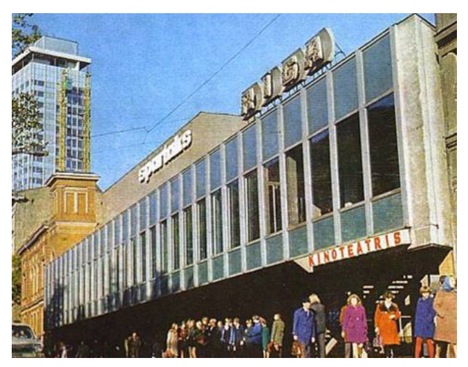
Fig. 6. The movie theatre "Spartaks", architect Marta Staņa, 1967. Photography of 1970-ties (Movie..., 2012)

In ten years Modern Movement spread to the other cities of Latvia as well. The building of the movie theater in Daugavpils (architects Olgerts Krauklis and Maija Skalberga, 1981) displays the principles of Modern Movement and the use of local building materials and building traditions established during the pre-war period (Fig. 7 and Fig. 10). Having resemblance to the House of Culture in Helsinki, built in 1959 to the design by Alvar Aalto, the streamlined external contour of the building and a monumental brick wall highlight the expressiveness of the Daugavpils movie theater (Fig. 9).