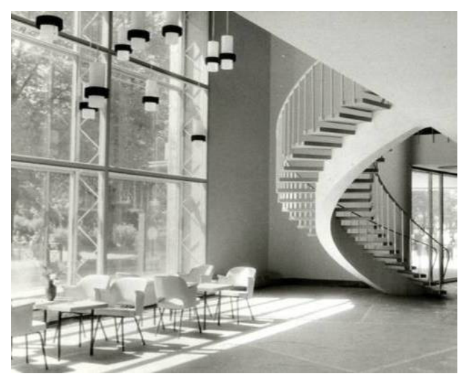
Fig. 5. The foyer of the movie theatre "Pionieris", architect Juris Pētersons, 1962 (Foyer..., 2012)

The ideas of open plan and Modern Movement rapidly spread in the mid-1960s. Movies were acknowledged to be folk art, and movie theatres were built extensively. Open design principles have been applied in construction of several movie theatres in the historic centre of Riga, e.g. the movie theatre "Palladium" and the movie theatre "Pionieris".