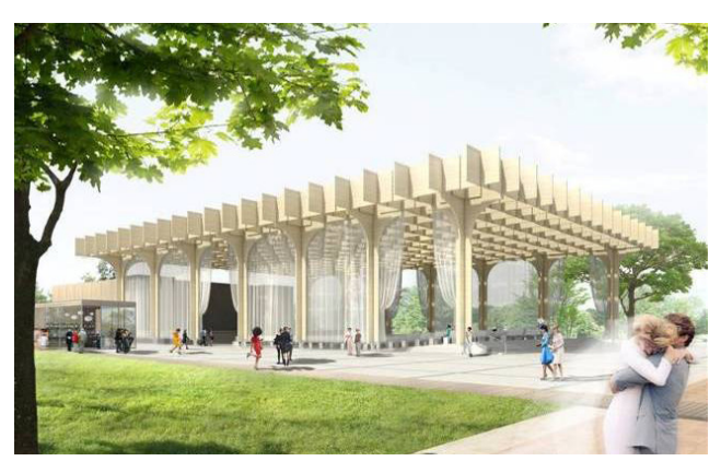
Fig. 2. A remodelling proposal for the concert garden "Pūt vējiņi" in Liepāja. "Mark arhitekti" LTD, 2010 ("Mark arhitekti" LTD, 2010)

The architecture of open-air stages of Jūrmala and Liepāja tended to retain the relation with the surrounding scenic environment. The main concept was based on transparency of massing and organic continuation of the scenery in the interior. Their concepts seem to be inspired by the Finnish architect Alvar Aalto and his humane treatment of landscape transformation.