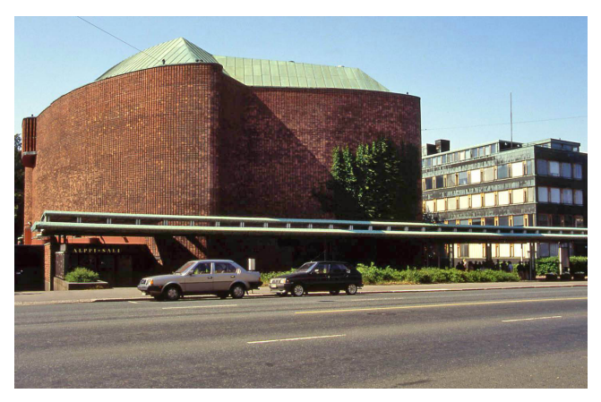
Fig. 9. House of Culture in Helsinki, architect Alvar Aalto, 1958 (Krastiņš, 1992a)