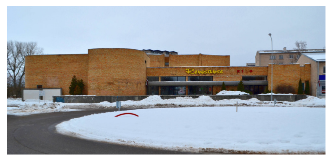
Fig. 7. The movie theatre in Daugavpils, architects Offgerts Krauklis, M. Skalberga, 1981

In ten years Modern Movement spread to the other cities of Latvia as well. The building of the movie theater in Daugavpils (architects Olgerts Krauklis and Maija Skalberga, 1981) displays the principles of Modern Movement and the use of local building materials and building traditions established during the pre-war period (Fig. 7 and Fig. 10). Having resemblance to the House of Culture in Helsinki, built in 1959 to the design by Alvar Aalto, the streamlined external contour of the building and a monumental brick wall highlight the expressiveness of the Daugavpils movie theater (Fig. 9).