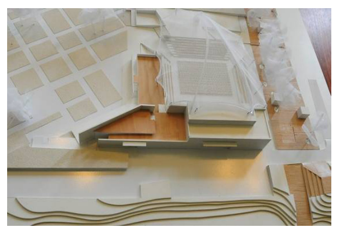
Fig. 1. A remodelling proposal for the concert garden "Pūt vējiņi" in Liepāja. "Kokin Idea" LTD, 2011 (Reconstruction..., 2011)

In the early 1960s, light music had taken centre stage encompassing also art and cinema. In 1965, the popular and beloved composer Raimonds Pauls became manager of Riga Light Music Orchestra. In 1967, the joint concert of light music bands in Liepāja on the stage "Pūt vējiņi" ("Blow, wind, blow") was given the name "Amber of Liepāja". It was attended by about 30,000 spectators (Kreituse 2010). The stage "Pūt vējiņi" in Liepāja was designed in 1961. Today, however, it is in a very poor condition and requires extensive modification for its further development. Several proposals for transformation were submitted at the open sketch design competition which ended in 2011. All architects mostly used a considerate approach offering to retain the existing stage structure, preserving spatial qualities and a relation with the coastal scenery, creating a new roof construction (Fig. 1 and Fig. 2).