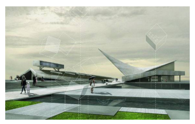
Fig. 3. A competition entry for an open-air stage in Jelgava, 1968. Architect Marta Stana. Authors of visualisation "Mark arhitekti" LTD, 2009 ("Mark arhitekti" LTD, 2009)

The competition entry developed by architect Marta Staṇa in 1968 for an open-air stage in Jelgava ("Mark arhitekti" LTD, 2009) illustrates the blending of deep-rooted folk traditions and aesthetic principles of Modern Movement into a single architectural image (Fig. 3 and Fig. 4).