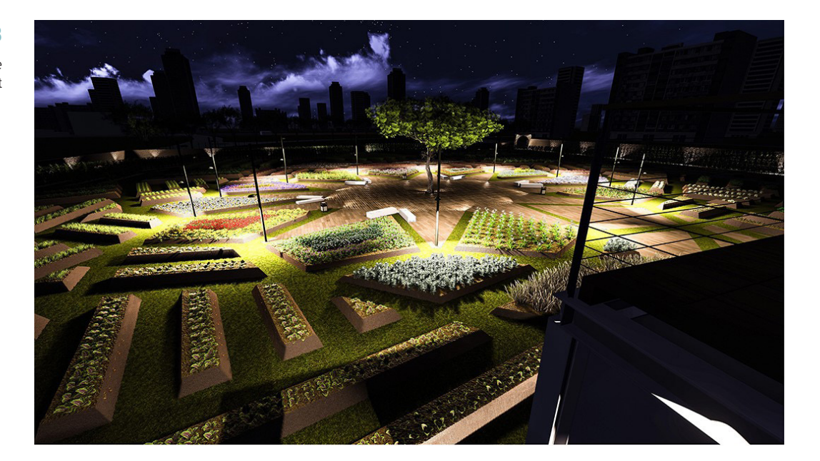
Fig. 8 General rendering of the area by night