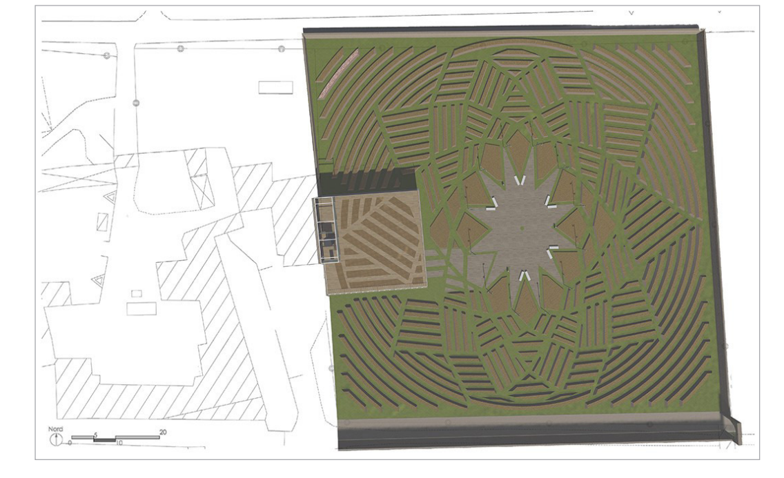
Fig. 2 General masterplan

The synergistic orchard nature value therefore requires careful programming of the provision of crops in function of their seasonality, their growth and the size and height of the plants, as well as the type of cultivation.