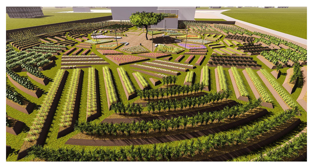
Fig. 6 General rendering of the area