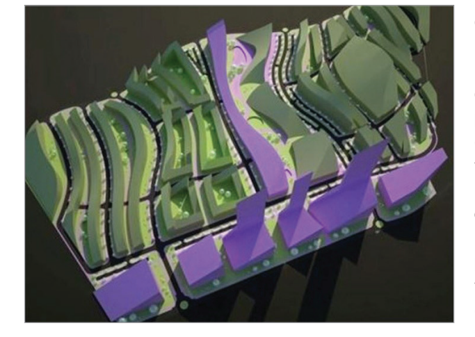
Fig. 9 Solar envelope used in a scale of a settlement, 3D model of final urban structure. Authors: Mihaľková, Martinkovičová, 2011 in studio led by architect Klára Macháčová

faculty as well as subject of further development. In recent years, its use has been verified for structures of larger dimensions, such as zones or districts. This could be the greatest potential of the solar envelope method, as it could help to define limits for build-up of areas, especially for intensive exploitation of energy efficient houses and solar architecture (Fig. 9). However, adoption of this powerful and efficient design tool for constructions in reality, remains questionable.