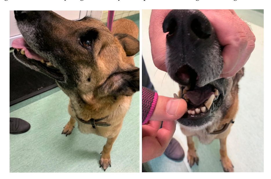
Fig. 1. Muscle atrophy in the temporalis area (Before treatment); Fig. 4. Tongue is wet, thin with crackles. (Original archive)

The TCVM diagnosis was Kidney Jing Deficiency and Spleen Qi sinking with Lung Qi Deficiency.