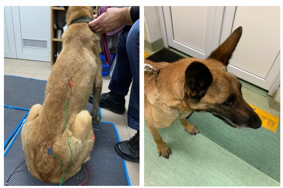
Fig. 5. Aspects during electroacupuncture treatment. Fig. 6. After 4 treatments. (Original archive)

We maintained the treatments for over two months, with significant improvement in breathing (only occasionally cough) but a mild response in muscle atrophy (Figure 6). The dog had a good appetite and began to be more active and playful, that she'd been previously.