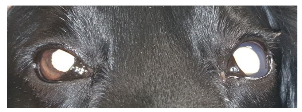
Figure 4. English Cocker Spaniel, 8yo FN- Primary closed angle acute congestive glaucoma left eye, note the anisocoria with dilated left pupil, diffuse corneal oedema, third eyelid protrusion

Primary sudden onset congestive glaucoma is easier to recognize as the dog will be typically middle age, female and will have absent menace response, fixed dilated pupil +/- absent dazzle reflexes, diffuse corneal oedema, episcleral congestion and conjunctival hyperaemia (Fig. 4). Cases of secondary glaucoma are more difficult to recognize solely based on the clinical signs but one should carefully look for signs of uveitis, retinal detachment or intraocular neoplasia, mid-dilated pupil with absent PLR and reduced or absent menace response.