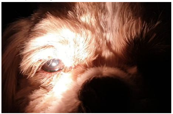
Figure 10. Assessment of dazzle and pupillary light reflexes (North Downs Specialist Referrals)

The dazzle reflex (Fig. 10) is a subcortical reflex (mediated by reflex centers in the midbrain with fibers to the facial nucleus) whereby a strong light shone into the eye leads to blinking, globe retraction, third eyelid protrusion, and/or head movement [1]. This is helpful when the ocular media are opaque (hyphaema, cataract) and when the menace response and/or PLRs can't be evaluated. However, it doesn't indicate that the eye is visual, as this reflex can still be present even after retinal detachment due to the presence of a subspecialized population of retinal ganglion cells that are involved in the control of the PLR. Though, when the dazzle reflex is absent in a dog with high IOP it most likely indicates retinal damage and unless immediate action is taken (medical treat-ment/aqueous centesis), blindness is likely to be permanent.