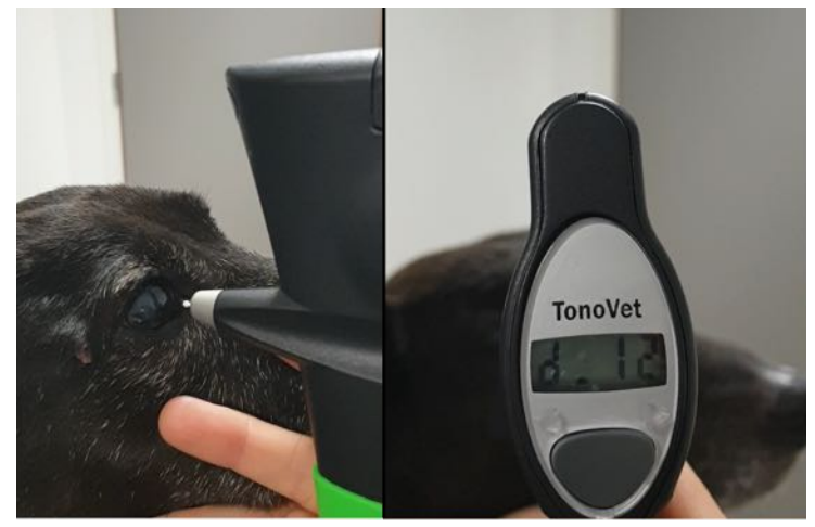
Figure 11. Estimation of the intraocular pressure using the TonoVet (rebound tonometer) in a dog

and the rebound tonometer (TonoVet, Fig. 11). Tonometry is also useful for identifying low IOP, which is common with anterior uveitis; normal values vary between individuals and time of the day (diurnal variation). Normal reported range for the IOP in dogs is 10-20 mmHg. Diurnal variation has been reported in the dog with higher IOPs in the early morning, therefore IOP curves (IOP checks every 3 hours over 24 hours in hospital regime) may be recommended in order to detect IOP spikes in dogs predisposed to or diagnosed with glaucoma [6].