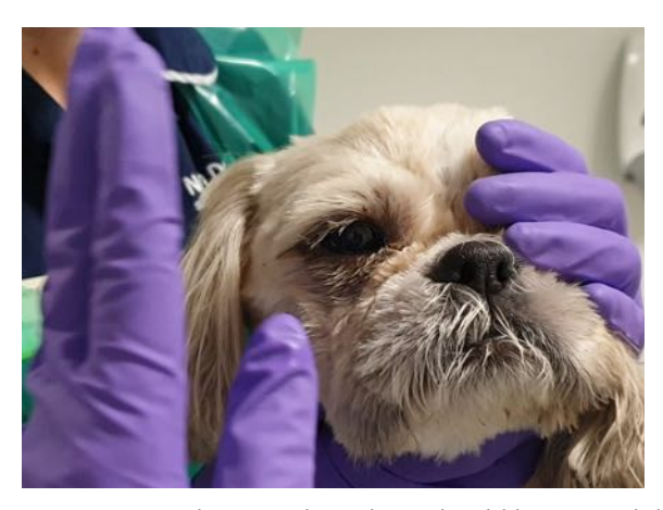
Figure 9. Evaluation of the menace response- note the contralateral eye should be covered during the assessment

To avoid false positive response from the visual, contralateral eye, the menace response should be evaluated in one eye, while the other eye is covered. It is important to avoid touching the eyelashes/hairs of the patient, or causing air movement, as this may also elicit false positive response. A facial nerve paralysis may cause a false negative response. Therefore, in the absence of a menace response the blinking reflex should be assessed by tapping the skin at the canthus. The menace response is absent in very young (<10–12 weeks) animals, and may also be affected by the patient's mental status [1, 5].