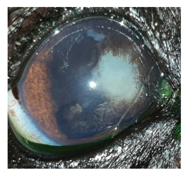
Figure 7. 13yo FN Miniature Schnauzer- chronic lens-induced uveitis and secondary pupil block glaucoma, under treatmentpigment dispersion on the surface of the iris and anterior lens capsule, posterior synechiae, fixed pupil (North Downs Specialist Referrals)

Secondary glaucoma can develop acutely, subacutely, or chronically and may affect one or both eyes. Clinical signs include ocular discomfort, blepharospasm, corneal oedema, episcleral congestion (Fig 8), third eyelid protrusion, miosis or mydriasis, uveitis, buphthalmos and/or blindness [1-3]. Cases of glaucoma may be mistaken for conjunctivitis or retrobulbar disease due to the conjunctival hyperaemia, third eyelid protrusion and ocular discharge.