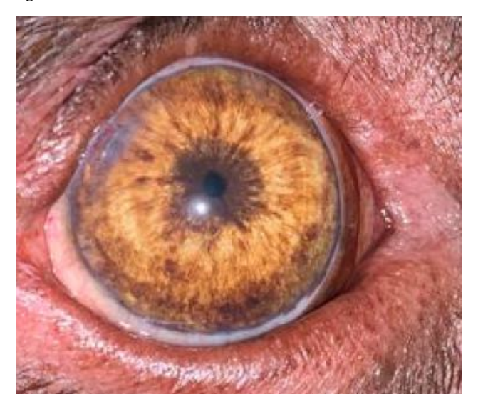
Figure 14. The effect of latanoprost application, leading to extreme pupil (North Downs Specialist Referrals)

Typically, a primary glaucoma patient will receive combinations of carbonic anhydrase inhibitors, beta-blockers and prostaglandin analogues (eg. dorzolamide, timolol and latanoprost) as ongoing medical treatment with frequency which depends on the IOP readings.