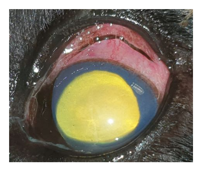
Figure 5. 8y6mo Cocker spaniel, FN with primary angle closed glaucoma – note the mucoid discharge at the medial canthus, third eyelid protrusion, moderate conjunctival hyperaemia, episcleral congestion, diffuse corneal oedema and dilated pupil

Clinical signs of chronic glaucoma (more common in secondary glaucoma):