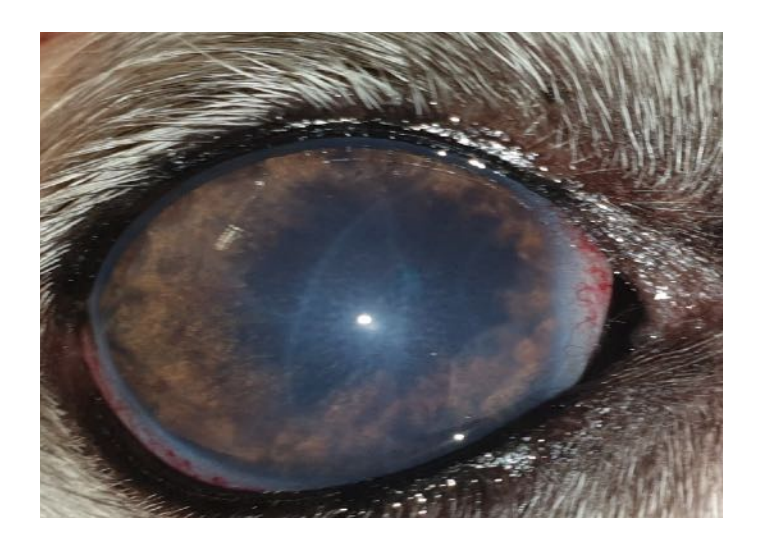
Figure 6. 6yo FN Whippet- Anterior uveitis and secondary chronic glaucoma- note the Haab's striae (curvilinear grey/white lines across the cornea), the pupil was miotic owing to the recent application of latanoprost

- Phthisis bulbi: this develops with advanced cases of glaucoma when the ciliary body stops producing aqueous humor.