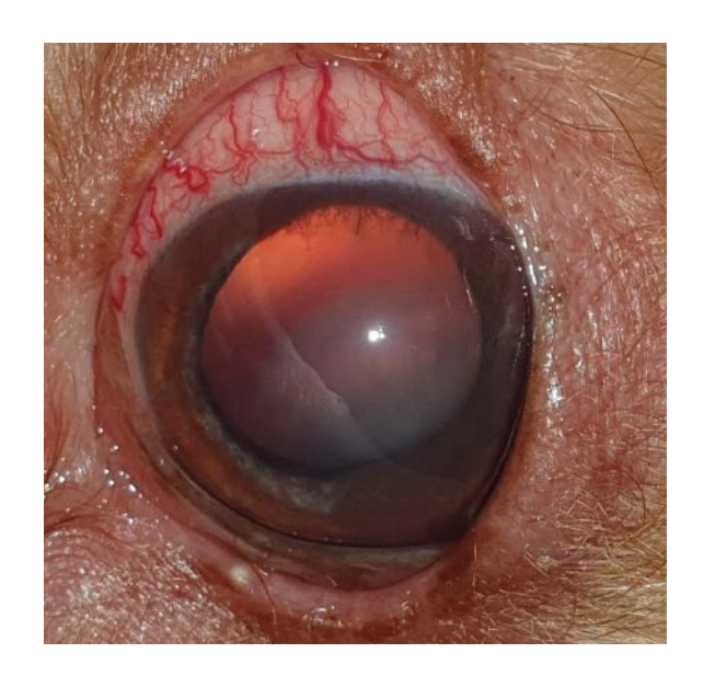
Figure 8. 8yo FN Miniature Poodle - posterior lens luxation and secondary glaucoma. Note the conjunctival hyperaemia, engorged episcleral vessels and the aphakic crescent dorsally indicating a posteriorly luxated lens. (North Downs Specialist Referrals)