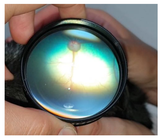
Figure 12. Indirect ophthalmoscopy using a 30 D Volk lens- note the optic disc at the top with the retinal vessels, tapetal fundus at the bottom (the image is inverted in indirect ophthalmoscopy) North Downs Specialist Referrals

2. Ophthalmoscopy : direct and indirect ophthalmoscopy (Fig. 12) may be used to examine the retina (look for hyperreflective striations or generalized hyperreflectivity) and the health of the optic nerve (Fig. 13, normally the optic nerve head should be well vascularised, the blood vessels should be seen crossing its border). Optic disc cupping (the blood vessels stop at the rim of the optic disc due to increased pressure) is the hallmark of glaucoma [1]; however, this may be difficult to notice in cases of acute congestive glaucoma due to the marked corneal oedema.