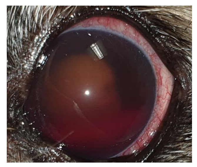
Figure 3. Uveitis, Border terrier, 7yo, MN- note the diffuse conjunctival hyperaemia, mid-dilated pupil, hyphaema, hypermature cataract

As the dog is presented with a red eye, other ocular diseases should be included on the differential list such as uveitis (Fig. 3), episcleritis, conjunctivitis, retrobulbar disease. It is not uncommon to misdiagnose glaucoma as conjunctivitis which leads to irreversible blindness due to the delay in the appropriate treatment. Distinguishing between various diseases that can cause ocular redness should be based on the result of the clinical examination (the presence of menace response, pupillary light and dazzle reflexes) and tonometry (when available).