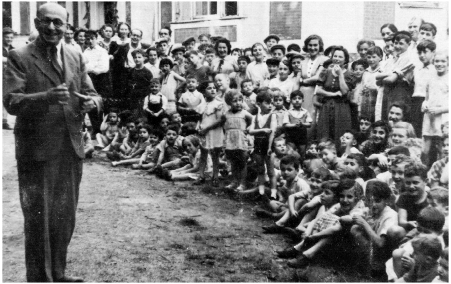
Ernst Papanek and the children of Villa Helvetia

It is necessary to note that the doors of OSE children's homes were always open for non-Jewish children, the majority of whom were children of German and Austrian political refugees.