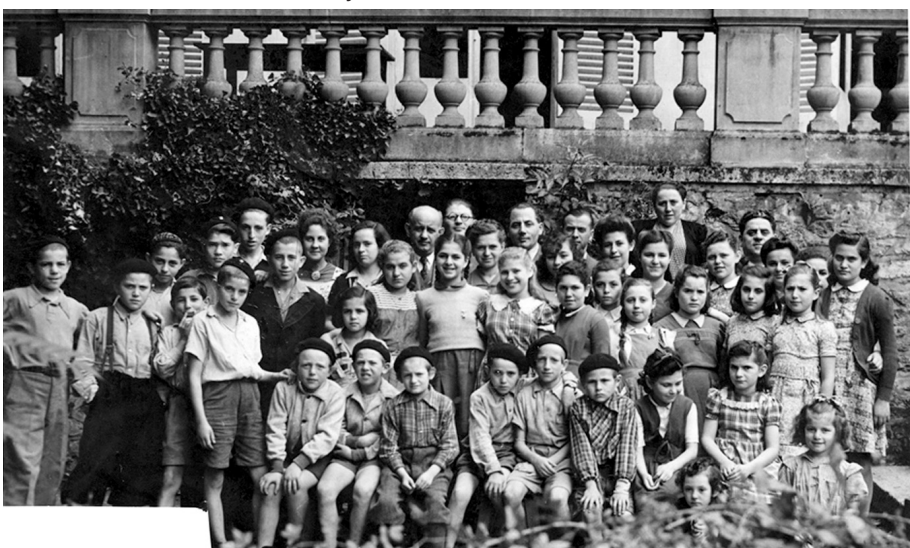
Figure 2 Children's Home in Montmorency, 1939