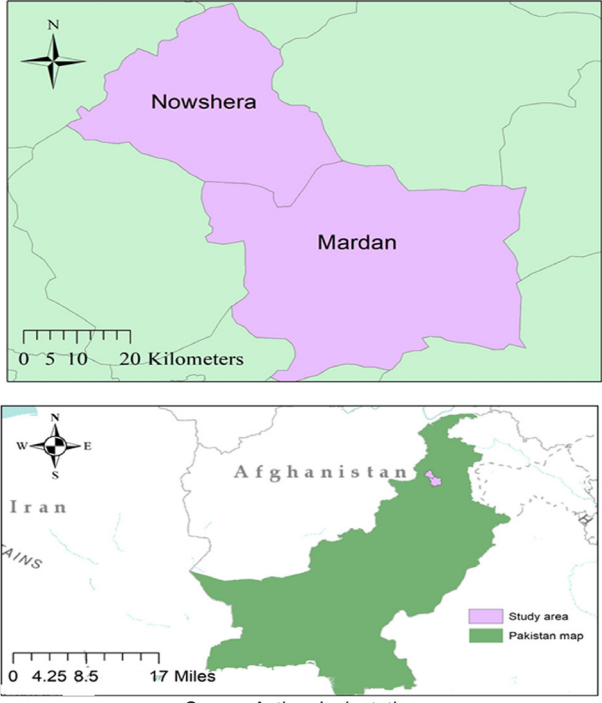
Figure 2 Study Area Map

This study has been conducted in two districts Mardan and Nowshera situated in the central zone of Khyber Pakhtunkhwa, a province of Pakistan (Figure 2). Mardan district has 2.3 million inhabitants and Nowshera has 1.5 million (PBS, 2018).