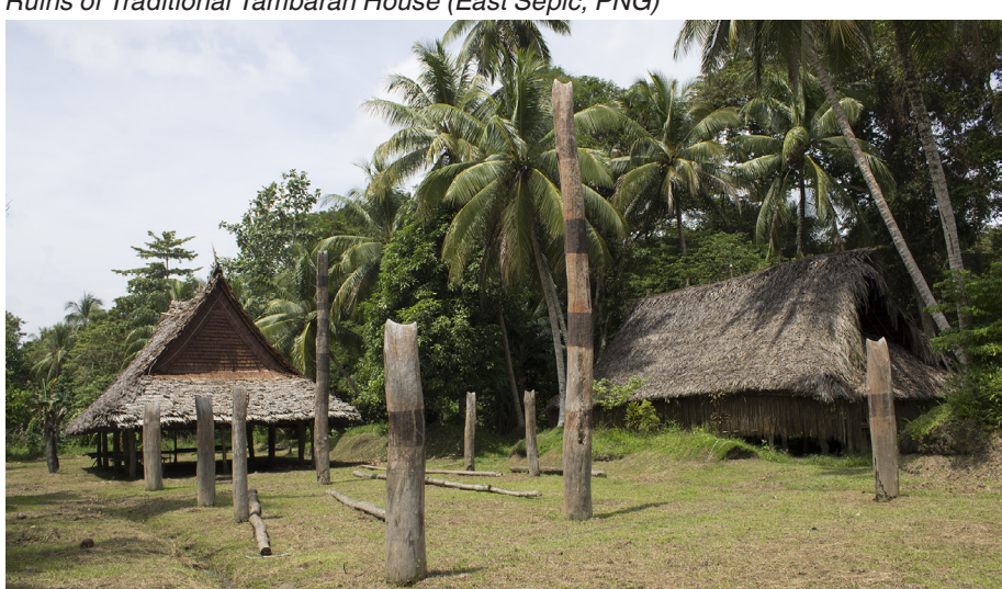
Figure 5 Ruins of Traditional Tambaran House (East Sepic, PNG)

Of the pre-Christian forms of religion, i.e. ancestor cults, cults related to plant growing, male cults and cults of sacred flutes (Lawrence & Meggitt, 1965; Sillitoe, 1998), magic has maintained its strongest position. Religion in PNG, as in the whole of Melanesia, is characterized by a tendency towards syncretism, in which both the original religious tradition and the new religion (in this case Christianity) are innovatively transformed. Religions in PNG (also elsewhere) are a synthesis of stability and change, past and present, as well as diachonicity and synchronicity (cf. Sahlins, 1985, p. 144).