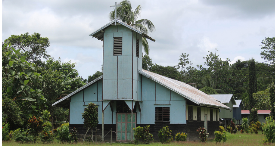
Figure 1 Catholic Church in Kambot (East Sepic, PNG)

River (a tributary of the Sepik) kept its carving tradition. In this village we find both a relatively large Catholic church (built of iron and sheet metal) [Figure 1] and a small Protestant prayer house (a building in its traditional form built of wood and bamboo, or reeds and dry grass) [Figure 2] [Figure 3] as well as a traditional tambaran house [Figure 4]. However, this no longer serves its original purpose, but functions as a kind of "cultural place" where a local carver offers his products. In addition, there is still