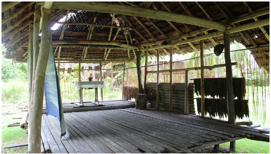
Figure 2 Protestant Church in Kambot, interior (East Sepic, PNG)