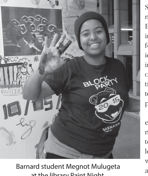
at the library Paint Night.

We painted new designs over most of the Twitter handles and some of the "Feel the Berns," After discussing the matter at a staff meeting, we decided to let "Feel the Bern" stand as protected speech.