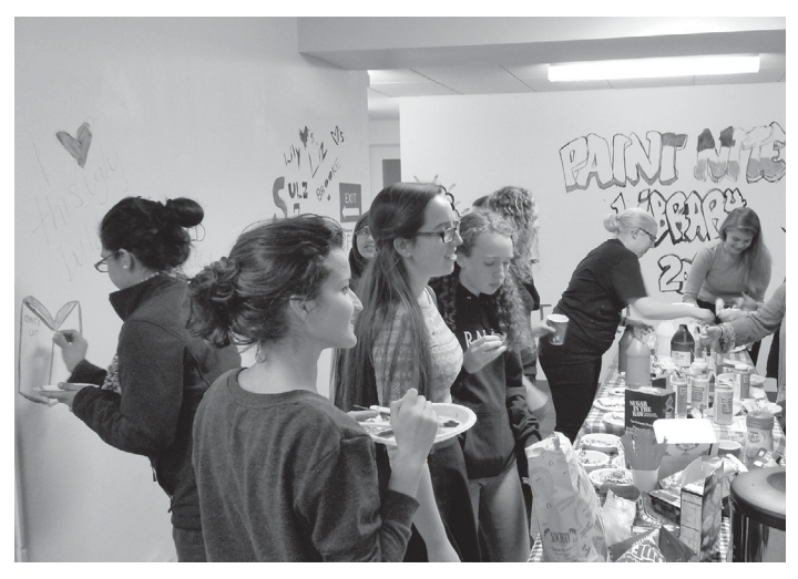
Students getting snacks and paint at Paint Night.

The facilities department also graciously provided the library with folding chairs that were not in active use