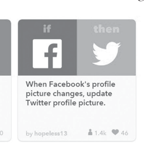
library Example of Twitter recipes from If This Then That. tweets,

"There is a person on the third floor of the library who appears to be fainting." If an API notification is sent when the word library is mentioned, library staff can verify whether someone did fall ill.