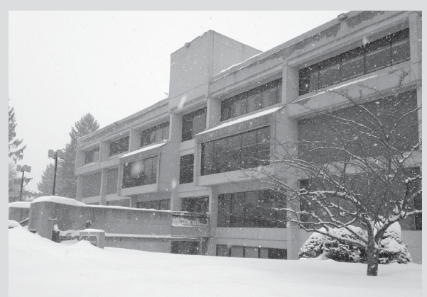
The Babson Library during a recent snow storm.

New methods also provided patrons with high-quality assistance. When staff realized that winter weather was bearing down, they developed a new strategy for opening the library with "snow