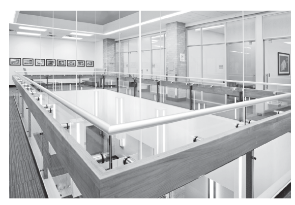
The NUMC Health Sciences Library's second floor features a large opening in the floor, which creates the library's atrium.

The Peter W. Addiego Health Sciences Library at the Nassau University Medical Center (NUMC) in East Meadow, New York, recently underwent a renovation and upgrade. Located