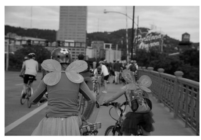
Portland Bridge Pedal.

This might be a good time to talk about pronunciation. Willamette is not pronounced "willuh-MET"; it's pronounced "will-LAM-et" as in "Willamette, damn it!" The proper pronunciation of the state