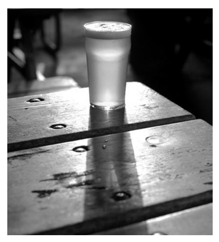
Portland microbrew.

About the same time, Republican governor Oswald West realized that the pattern of wealthy individuals buying up oceanside