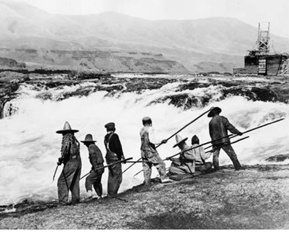
Native Americans spearing fish at Celilo Falls with fishwheel in background, c.1905, www.ohs.org/education/oregonhistory/historicviewer/CeliloFalls/celiloFalls1905.html.

After things dried out. Native American tribes arrived. Most made their lives by fishing, particularly for salmon and, for some tribes, lamprey eels. One of the best fishing spots was Celilo Falls (about 30 miles east of Portland), where the Columbia