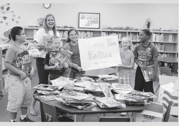
braries Award Students and their teacher at Fern Creek Elementary cellence in in the college School show their appreciation for the Rollins College do-Academic Lination.

The money for the donation came when the Olin Library was presented the 2013 ACRL Excellence in Academic Libraries Award in the college category.