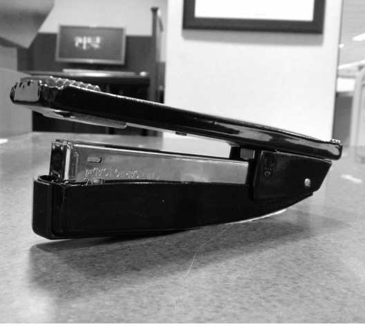
Stapler 9 is dead at the age of 36 days.

Some staplers lasted no more than one day. The longest living stapler succumbed