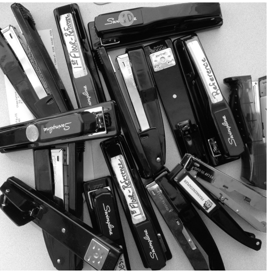
A dead stapler funeral pyre.

diana University's law library newsletter, "Res Ipsa Loquitur." The library's associate director described scenes where law students were observed placing staplers on the floor and "using their feet to push the levers." She added, "We cannot continue to use Library resources to purchase staplers that are going to be abused. The solution is in your hands-take care