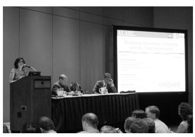
Speakers at the Anthropology and Sociology Section program.

A LA's 132st Annual Conference was held June 27–July 2, 2013, in Chicago. Approximately 26,362 librarians, library support staff, exhibitors, writers, educators, publishers, and special guests attended the conference. Ed. note: Thanks to the ACRL members who summarized programs to make this report possible.