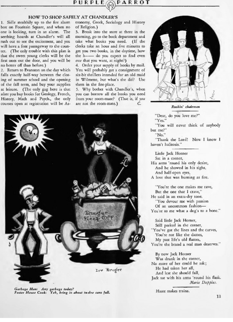
Selection of one-panel comics and jokes from October 1929 issue of Purple Parrot. View this article online for a more detailed image.

Transportation Library; Evanston (Illinois) City Directories (circa, 1879-1923) from the University Archives; and most recently the Purple Parrot, a humor magazine published by students at NU from 1921 to 1950 (also from University Archives). The Purple Parrot contains short stories, poetry, essays, jokes, and