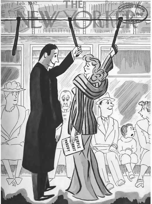
New Yorker parody cover of Purple Parrot, February 1942.

The Internet Archive does the actual scanning of the submitted materials, using custom-designed Scribe scanning stations. These scanning stations are actually stands mounted