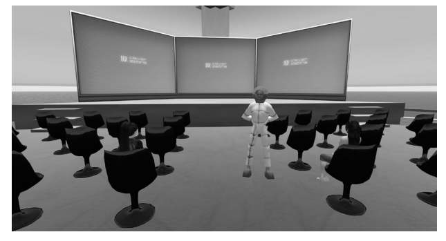
Screenshot of Kitely.

• Kitely. Kitely is another OpenSim platform with different hosting options as well