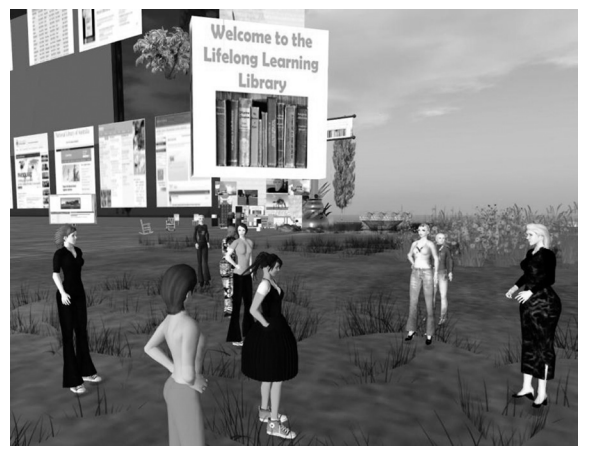
Screenshot of Jokadia.

• Jokadia. JokaydiaGRID is an OpenSimbased virtual world focused on Education and