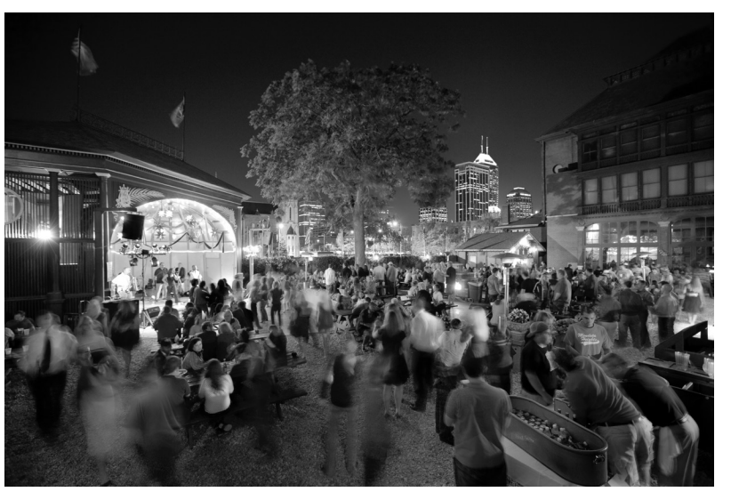
The Rathskeller Biergarten.

Theatre on the Square (627 Massachusetts Avenue, www. tots.org/). Located in the heart of Mass Ave., Theatre on the Square is a longstanding community theater in the city of Indianapolis. Its productions are typical new plays and musicals of the Off-Broadway