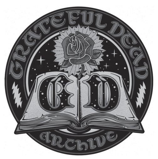
der the superb care Grateful Dead Archive logo by Gary Houston.

This is in many ways the antithesis of the Shellenbergian model of winnowing an abundance created by well-organized records management that smoothly transitions into an archive. Instead, it is an exercise in archival paleontology, where the archivist is more than just a good field archivist but also a cultural historian, charged with ferreting out and assembling records from a wide array of fans, former employees, and band family to flesh out a skeleton whose dimensions have to be determined from public documents,