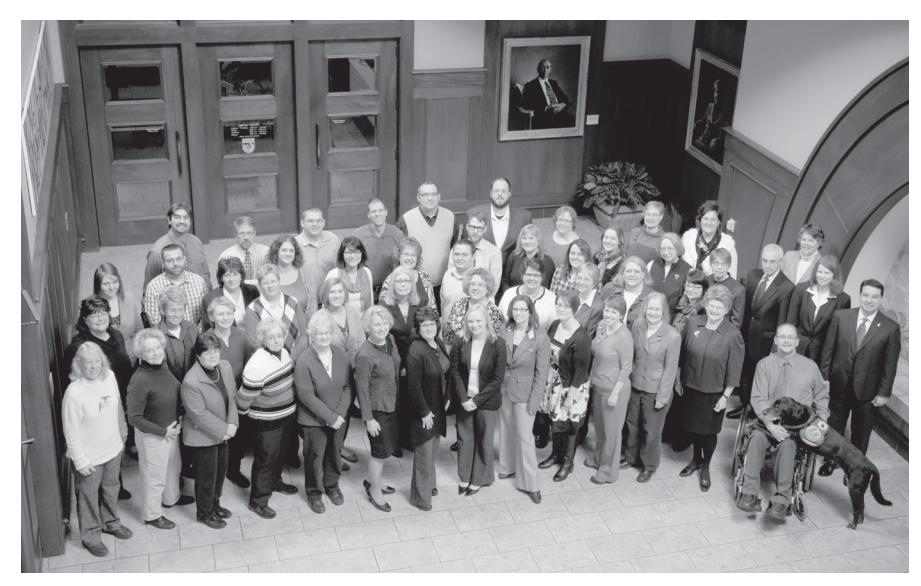
Staff of the Grand Valley State University Libraries.

ded in the core curriculum and assessed through established rubrics. Surveys indicate that students have come to recognize the technology and information literacy core competency as most important to their academic success. It is clear that these librarians love what they do and spark creativity by working as team."