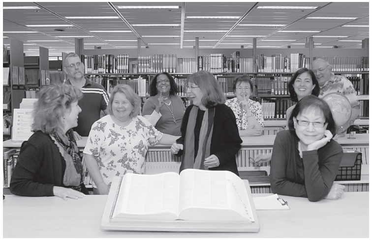
Staff of the Seattle Central Community College Library.

she is a committed advocate for information literacy, an innovative leader, and a commendable professional."