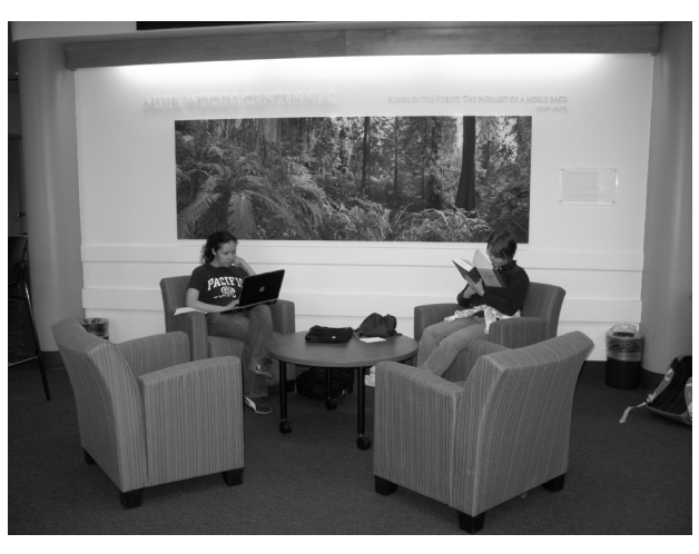
how art featuring The Muir Woods image offers an artistic focal point for the Study nature scenes or Commons area of the University Library.

the study commons helps to ensure that its aesthetic beauty and underlying message are appreciated by large numbers of students The image also has the impact of bringing the natural world into the building. It offers a vivid example of themes can con-