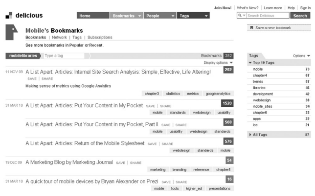
Project bookmarks on Delicious. Visit this article online for detailed images.

Delicious is just one of many social bookmarking services; you might prefer another. You should know that after acquiring Delicious in 2005, Yahoo! announced in December