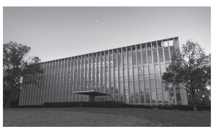
Hunt Library by day. View this article online for color images.

philanthropy to CMU. It began about 50 years ago, when Roy A. Hunt and his wife offered to build what would be the first central library on campus. Flanked by the classical yellow brick buildings of the original campus plan, the postmodern five-story Hunt Library has been a distinctive campus focal point since 1960.