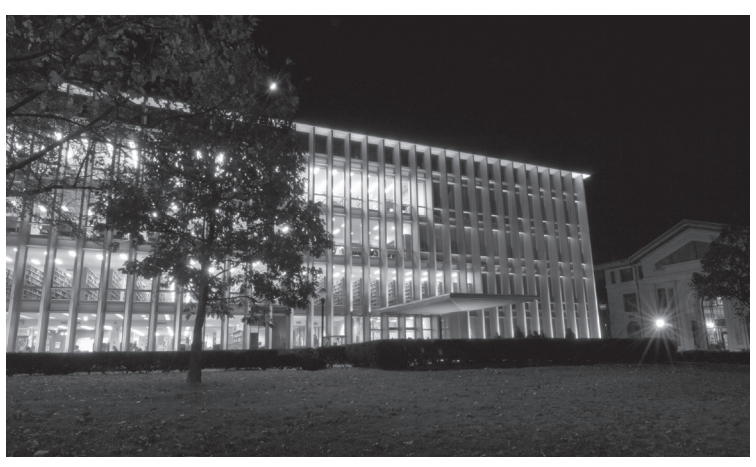
Hunt\ Library\ transformed\ by\ night. For\ a\ video\ of\ the\ Hunt\ Library\ Light\ Show\ visit:\ www.youtube.com/watch?v=tO2ul3JBoTg.