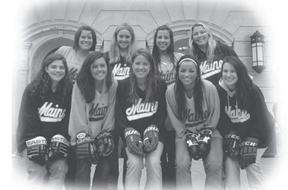
Women's Ice Hockey