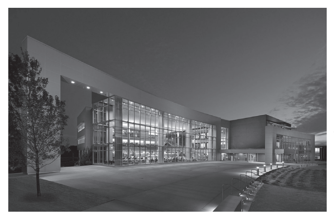
North façade and plaza at night at the Georgia Gwinnett College Library and Learning Center.

The U.S. Green Building Council awarded the Leadership in Energy and Environmental Design (LEED) Gold certification to the recently completed Georgia Gwinnett College (GGC) Library and Learning Center in Lawrenceville, Georgia. Designed by international architecture, planning, engineering, and interior design firm Leo A. Daly, GGC's facility is the first academic library in Geor-