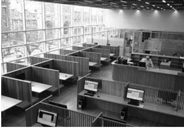
Interior of the new Columbia University Science and Engineering Library.

Columbia University's new Science and Engineering Library opened in the university's Northwest Corner Building on Janu-