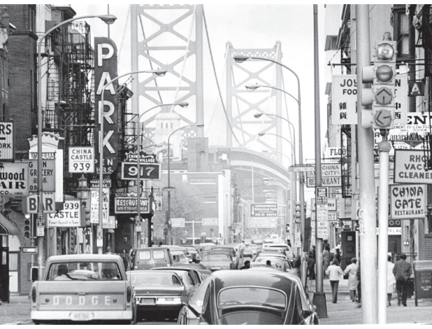
Chinatown and the Benjamin Franklin Bridge from Tenth and Race Streets. Philadelphia Evening Bulletin , 1973.

Another distinct product of the Society Hill's rehabilitation came in 1963. I. M. Pei's three modern skyscrapers, Society Hill Towers, emerged, towering over the old houses in a strong break from the neighborhood's older architecture. Headhouse Square, which sits at the cobblestone intersection of 2nd and Lombard Streets, is an old market that remains a popular draw for vendors and public events. Society Hill is a pleasant, walkable residential historic district where visitors can revel in restored 18th- and 19th-century Philadelphia architecture.