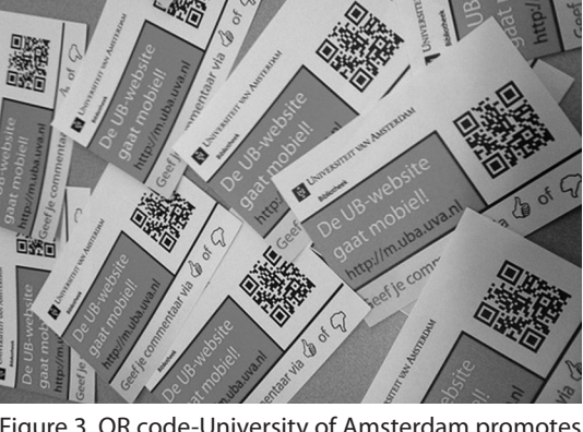
Figure 3. QR code-University of Amsterdam promotes their mobile site.

a QR code (which can be added to a mobile device home screen for future reference), will be placed on promotional materials, most likely a bookmark or small card of some kind along with the library logo, and distributed widely in physical spaces around campus, as