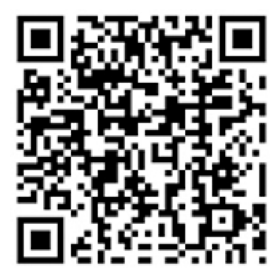
Figure 1. QR Code for a George Fox University (GFU) Library video playlist.