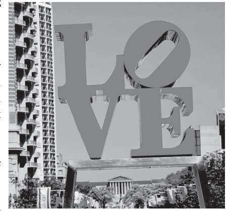
LOVE by Robert Indiana. All photos courtesy Philadelphia Convention and Visitors Bureau.

World Live Café (3025 Walnut Street, www.worldcafelive. com/). The World Live Café, six blocks east from the Zellerbach Theatre in