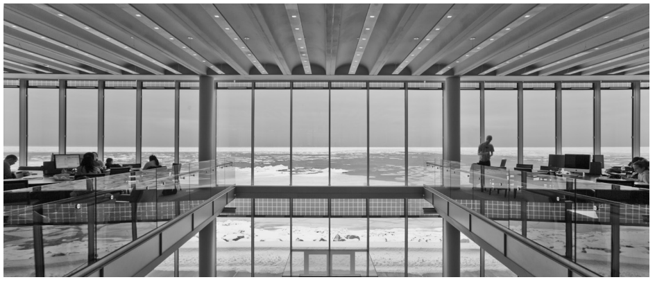
View of Lake Michigan from inside the Loyola University Richard J. Klarchek Information Commons Building.

group who takes action against oppression out of a belief that eliminating oppression benefits everyone." In presenting the award, the center and LGBT students described the library as "a place of learning, place of resources, and place of refuge," supporting everyone that learns, lives, and works at the college. The library and its staff were cited for being a sustaining force for the campus LGBT community. The center cited the li-