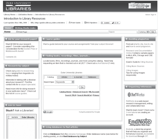
Figure 4: Library Guides ("default" LibGuide).

There are also a number of interdisciplinary subject codes that correspond to the interests—and, therefore, LibGuides—of multiple subject specialists. Similarly, there are a number of courses at Duke that are cross-listed under two, three, or even four subject codes. Each of these courses is arbitrarily assigned one subject code for the purposes of Black-