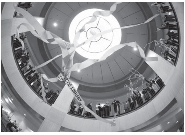
\stackrel{\hbox{\scriptsize ible}}{} study \stackrel{\hbox{\scriptsize space}}{} Dedication ceremony for the William Robertson Coe

million books. The Wyoming Legislature allocated $45 million for the project in 2005 and another $4.9 million in 2007. Private donors contributed $1.2 million. New spaces within Coe Library, designed to reflect student's learning styles, include flexquiet study spaces, Library. and the integration