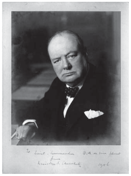
An inscribed photograph of Churchill taken during the war years