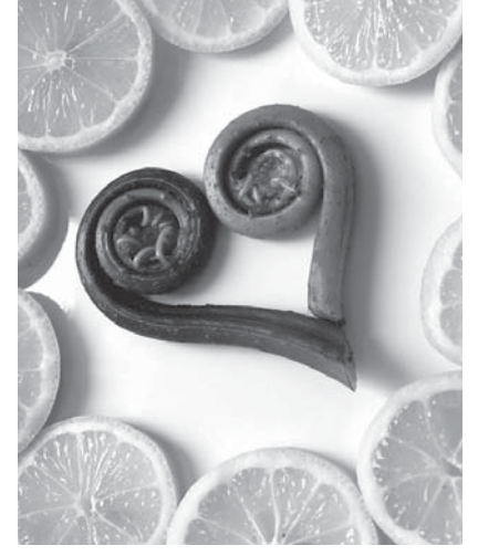
Fiddlehead ferns and lemon slices.