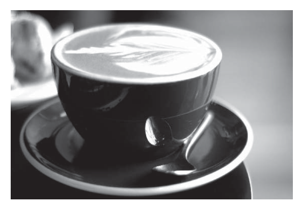
Latte at Stumptown in Seattle.

Cherries. Biringer Farm and the Maury Island Farm make local jams, jellies and preserves, which capture the sweetness of summer in every bite.