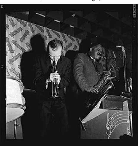
Jazz musicians playing at local club, Seattle, 1961.

when local band the Fleetwoods produced the first national pop hit from the Northwest