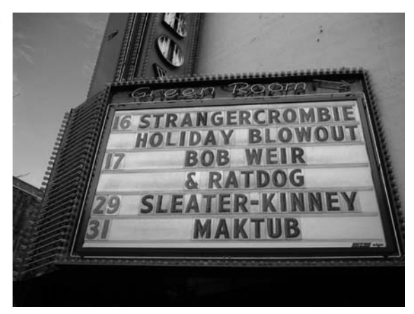
The Showbox marquee in Seattle.

hop record label in 1983 with DJ Nasty Nes, who also hosted Seattle's first hip-hop radio show; Sir Mix-A-Lot promoted the Seattle hip hop sound, and produced his own tracks.<sup>6</sup> Sir Mix-A-Lot gained national notice with his single "Posse on Broadway," which referred to Broadway Street in Seattle. Sir Mix-A-Lot later collab-