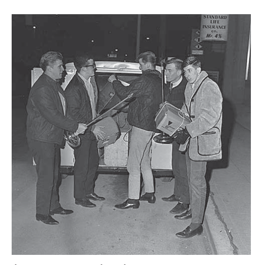
The Kingsmen loading instruments into trailer, Seattle, 1964.

and Seattleite Ron Holden's soul ballad "Love You So" reached the national top-ten Billboard list.<sup>2</sup>