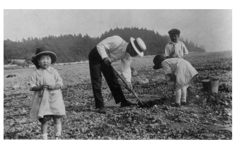
Family digging clams on Puget Sound, 1925.

cultural and commercial fair held in 1909 to promote the growth of the Pacific Northwest, the trade opportunities with Pacific Rim nations, and showcased the City of Seattle. It