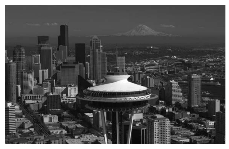
Seattle's Space Needle and Mt. Rainier, courtesy Seattle Municipal Archives, item #114444.

the Edge: Engage, Explore, and Extend," is not only an invitation to examine present and future trends of academic libraries, but it is also an opportunity to learn about Seattle's unique history, surroundings, culture,