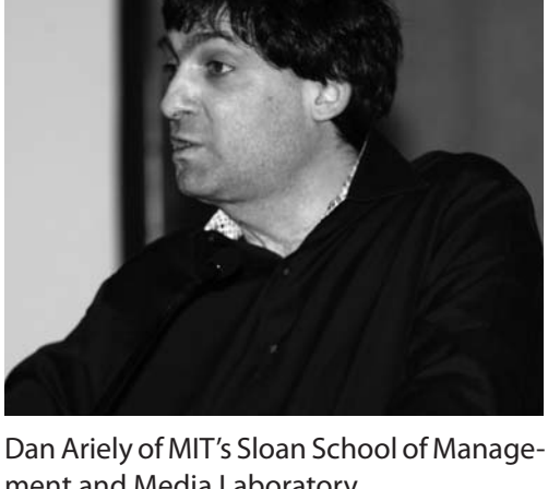
ment and Media Laboratory.

On the larger question of whether libraries in higher education in the United States today should increase spending or advocate for changing