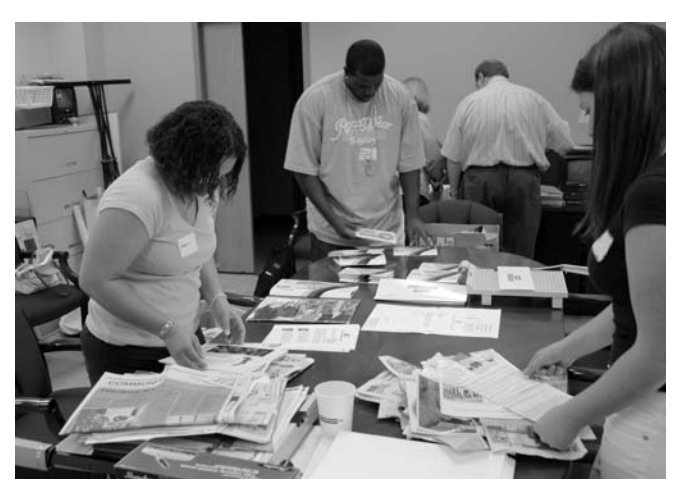
Wake Forest students work on a scrapbook project at the Hancock County Public Library in Bay St. Louis, Mississippi.

ments, and we were able to offer advice on how to make best use of what was available. Additionally, we carried a data modem that had an unlimited transmission plan so that, as long as we could connect to the AT&T mobile network, we could upload daily coursework. By combining a variety of approaches (including resetting one inn's router when the owner wasn't looking), we were successful in posting new content every day of the trip.