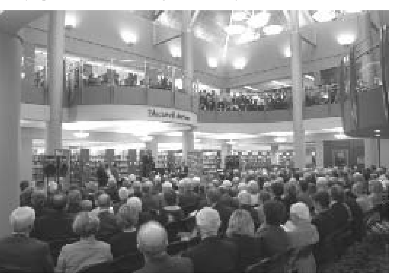
The Blackwell Atrium of Furman University's James B. Duke Library during the October dedication ceremony.

The complete 2004 e-book best sellers list can be found online at www.openebook. org/bestseller/year04.htm.