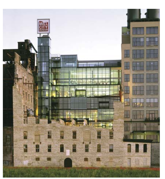
Mill City Museum was built within the ruins of the original Washburn A. Mill.

Across Washington Avenue from the Mill City Museum is the Minnesota Center for the Book Arts, which offers a multisensory environment with a gallery, printmaking and papermaking studios, deli, and gift shop. Great respect for the tradition of bookmaking is merged with the vitality of a cultural arts center. Exhibit information for spring is yet to be determined, but a visit regardless promises to satiate those who relish the tactile quality of books.