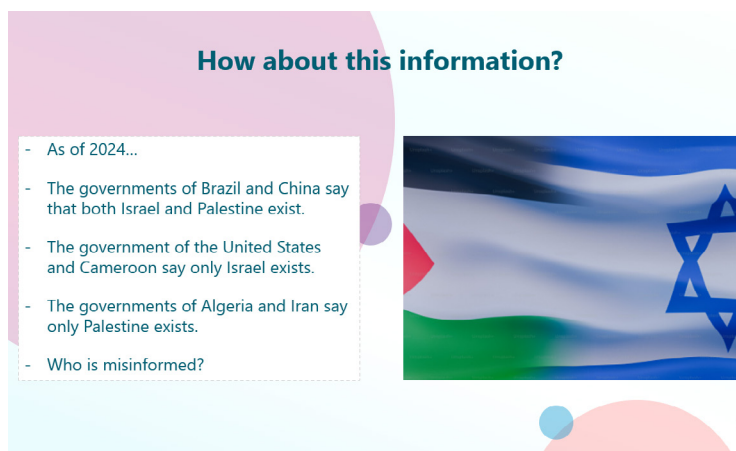
Figure 2: PowerPoint slide showing the intersubjective nature of information, using as an example a social issue students care about.

What makes an information-literate citizen? This is an important question for all teaching librarians to ask. Becoming information-literate begins from properly understanding what information is and how it functions in our age. It is said of our current epoch that we are held captive by information, a paroxysm of a sort, which results in impoverished attachment. Frederick Nietzsche once said, "From lack of repose our civilization is turning into a new barbarism." 13 If Stalinism had its beginning in a wrongheaded political ideal and Nazism in the national economic hardship in need of a scapegoat, then Trumpism has begun on a different ground. The seed may have sprouted from the lack of repose because of the excess of information. The library, an institution indispensable to the functioning of democracy, has a vital role to play in this era of unrest. ∞