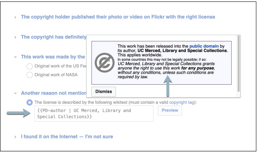
Figure 4: Sample copyright tag at the Release rights tab of the Wikimedia Commons Upload Wizard.

Now tell us why you are sure you have the right to publish this work: